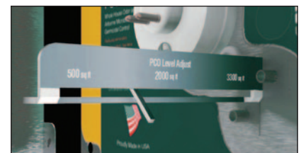
4" PCO Exclusive Adjustment